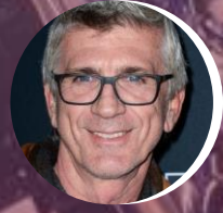
Joe Lando (Dr. Quinn, Medicine Woman)