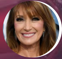
Jane Seymour (Dr. Quinn, Medicine Woman)